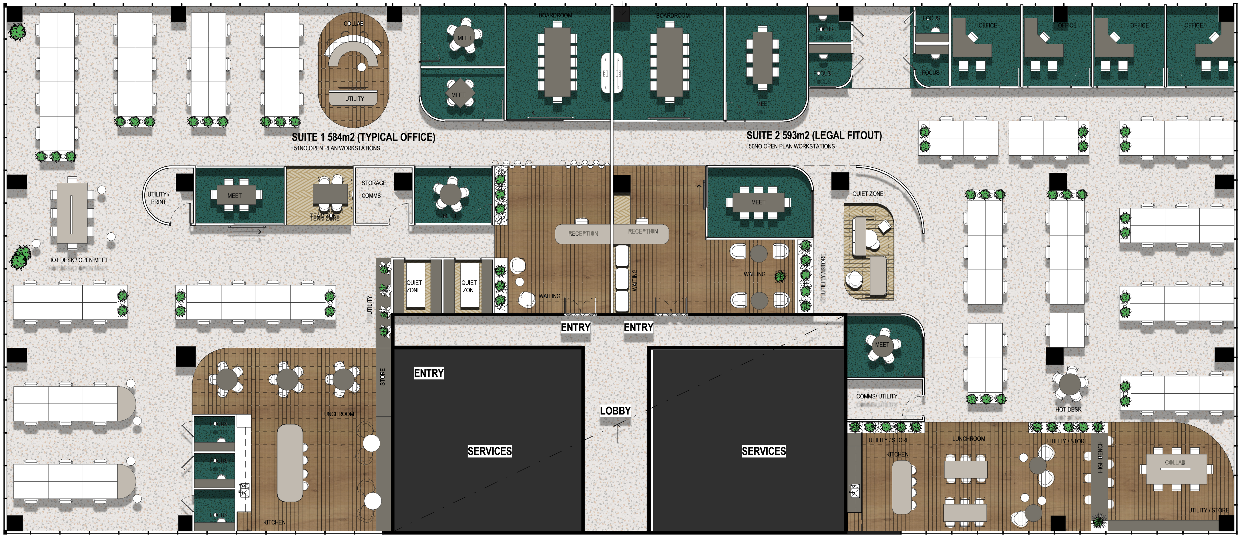
LEVEL 8 OPTION A SCALE: 1 : 100