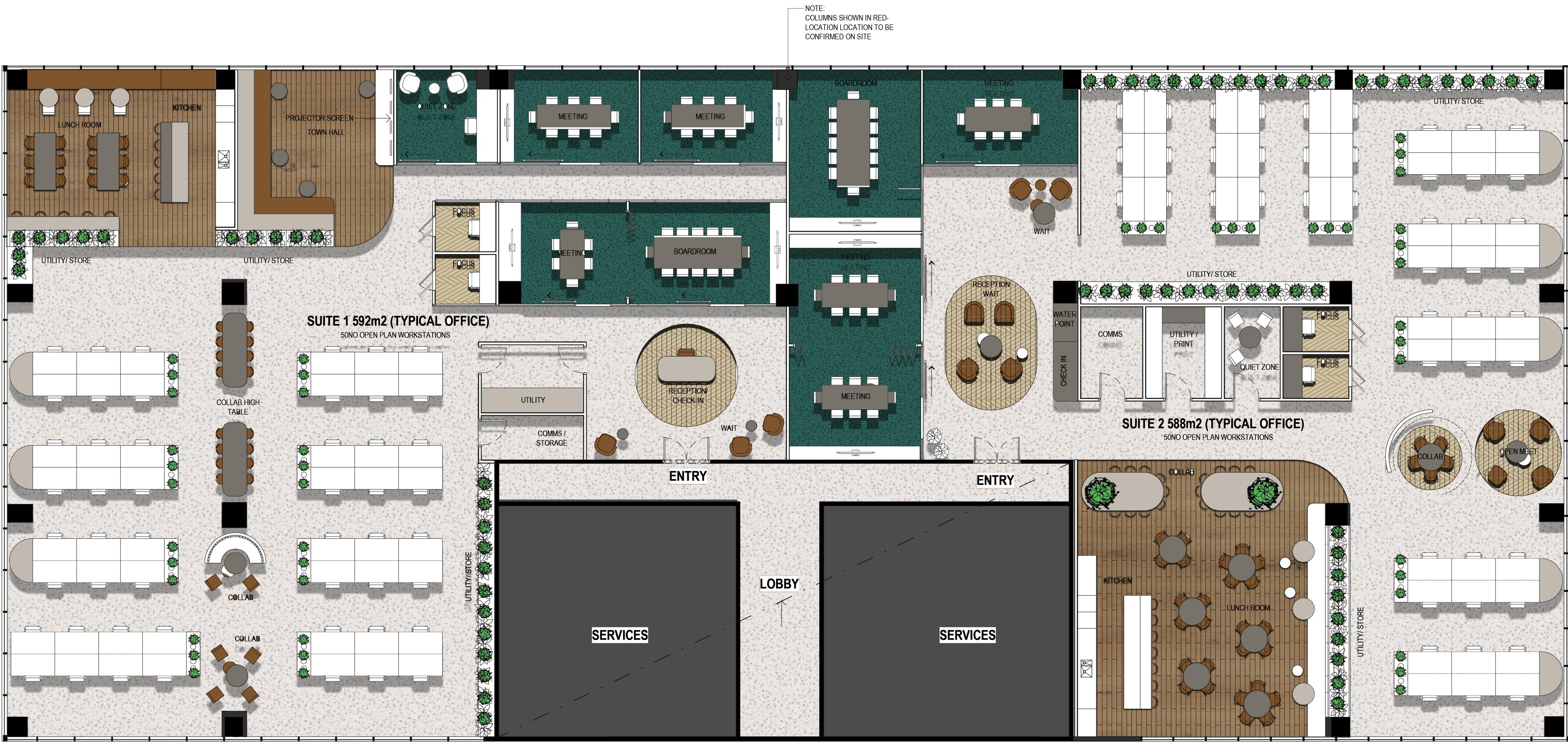
LEVEL 8 OPTION B SCALE: 1 : 100